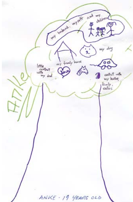
Anke, age 19

This selection of drawings was created by foster youth who participated in the Portals Of Wonder arts education workshop series that features fairytales and myths illustrated with magic, mime and music.