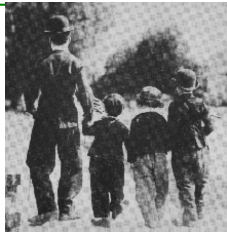
Charlie Chaplin and kids

In workshops and one-on-one master classes, Portals Of Wonder makes available rare books and publications, audio and visual demonstrations from the Portals Of Wonder Educational Research Library , accompanied by live demonstrations of techniques, methods and materials. Participants learn skills that build self-esteem, creativity and performing art skills that are transferable to reading, math, science, job and entrepreneurial settings, group presentations and self-expression.