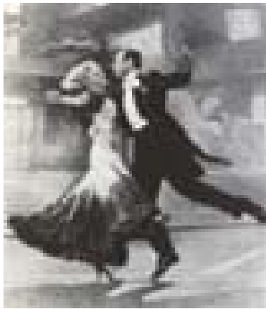
Fred Astaire & Ginger Rogers